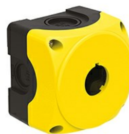
Plastic control station without actuators - for 1 actuators LPZP1A5